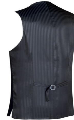
WAISTCOAT REAR DETAIL