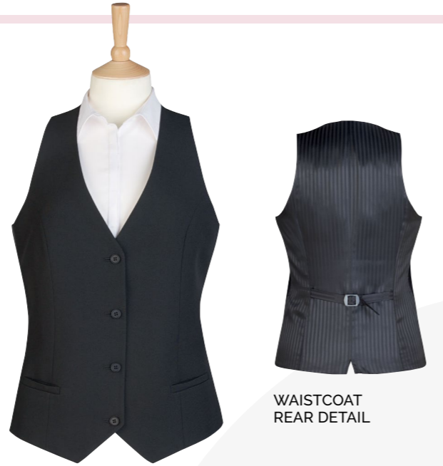
WAISTCOAT REAR DETAIL